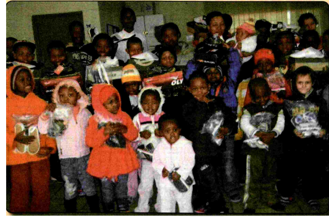
Children from Wide Horison Hospice receiving tekkies.